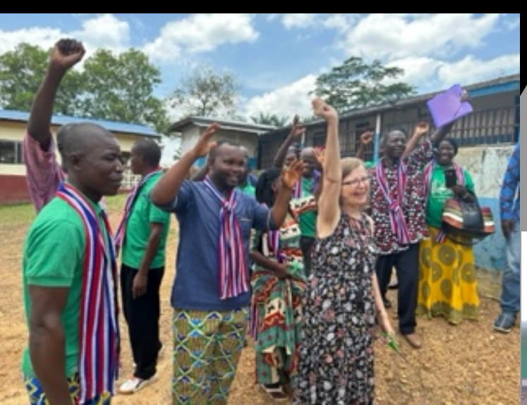
Ganta opening vocational College