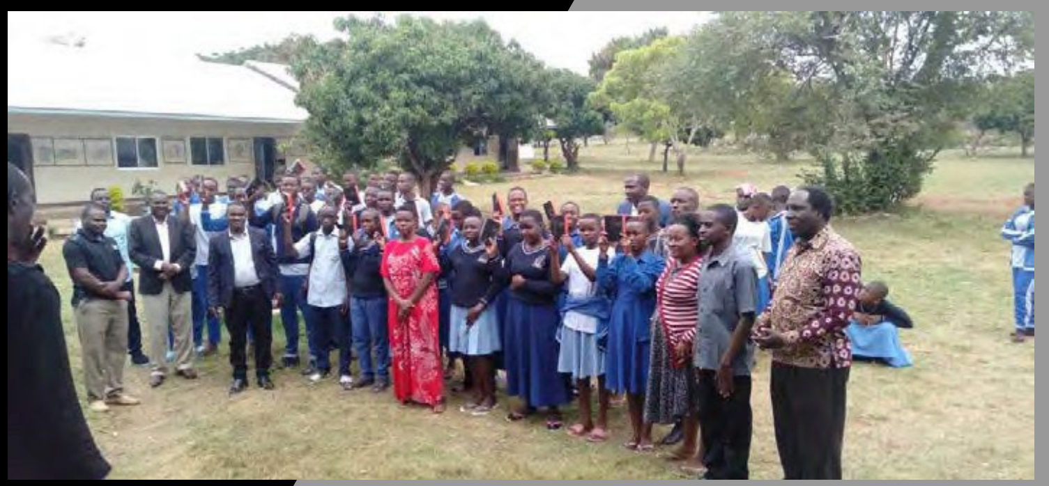
TJGIN Scripture Union in Schools (The Joshua Crusaders)