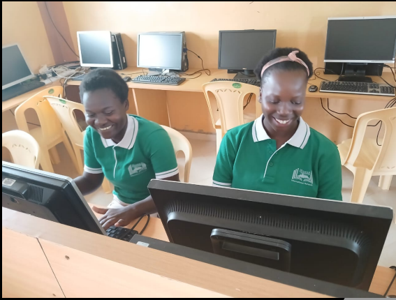
Computer training Kenya