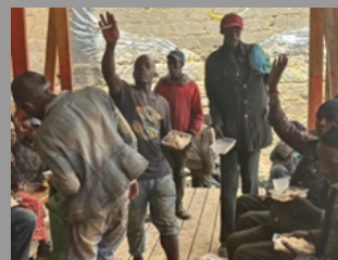
Feeding Programme Slums, 1000 people each month. Mathare Kenya