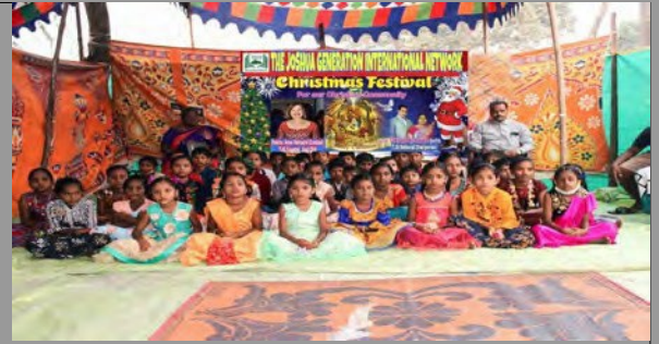
India orphans Below Bee Keeping