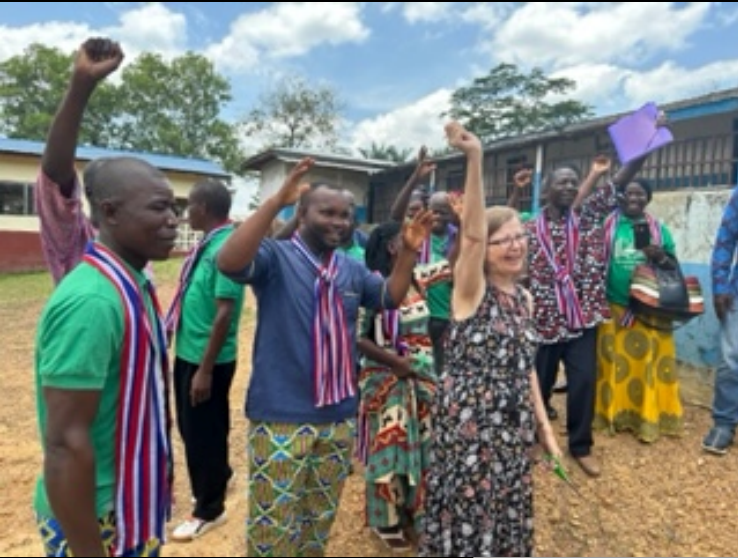
Ganta opening vocational College