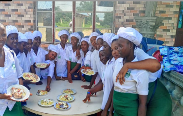
Catering Students Sierra Leone

Vocational projects Rwanda, Sierra Leone, Kenya, Liberia and Uganda, Guinea empowering vulnerable to pay own children's school fees