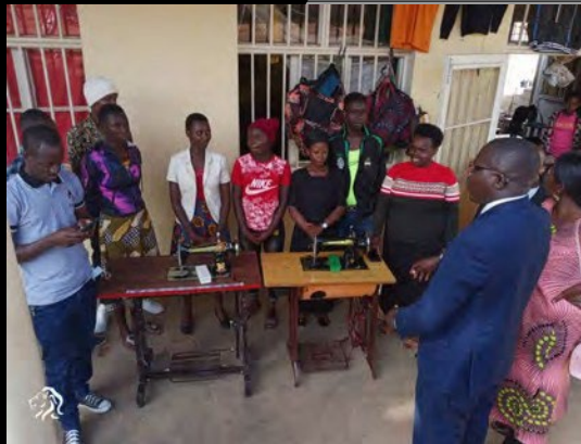
Tailoring Project Rwanda