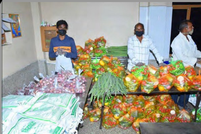
India Food for pastors