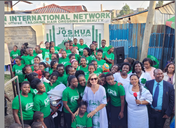
Vocational Training School Kenya