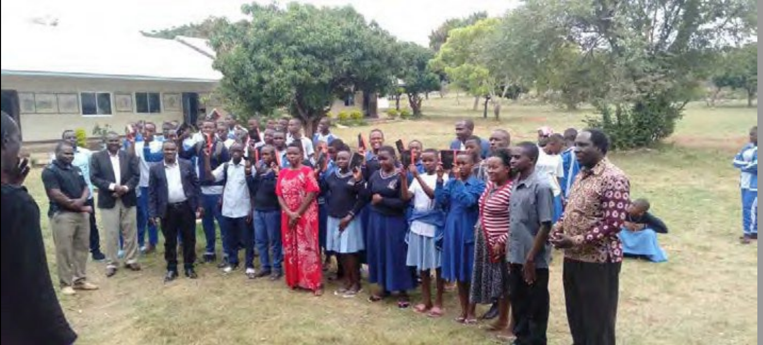
TJGIN Scripture Union in Schools (The Joshua Crusaders)