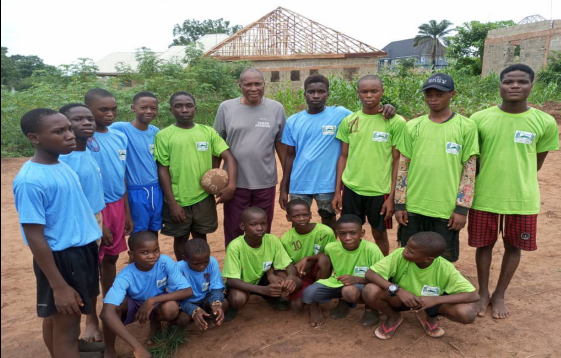
Football Team Nigeria